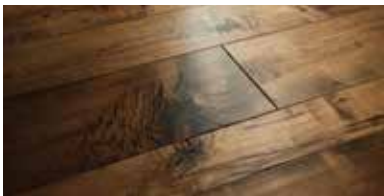
Bungalow Maple MY468BUNM