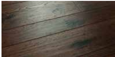
Casita Hickory MY468CASH