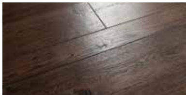
Gaucho Hickory MY468GAUH