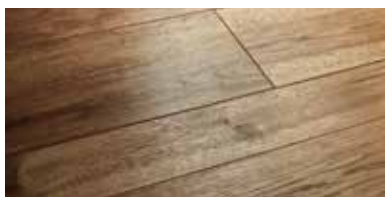
Ranchero Hickory MY468RANH