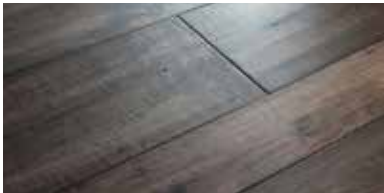
Bacarra Maple MY468BACM