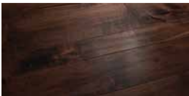
Caballero Maple MY468CABM