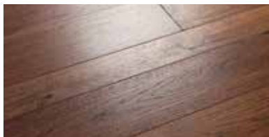
Puebla Hickory MY468PUEH