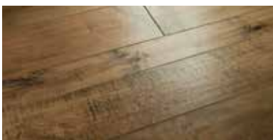
Cabana Maple MY468CBNM